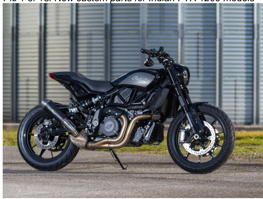
Pic 2 of 13: After the upgrade: sporty, high-quality and full of ideas

Pic 1 of 13: New custom parts for Indian FTR 1200 models