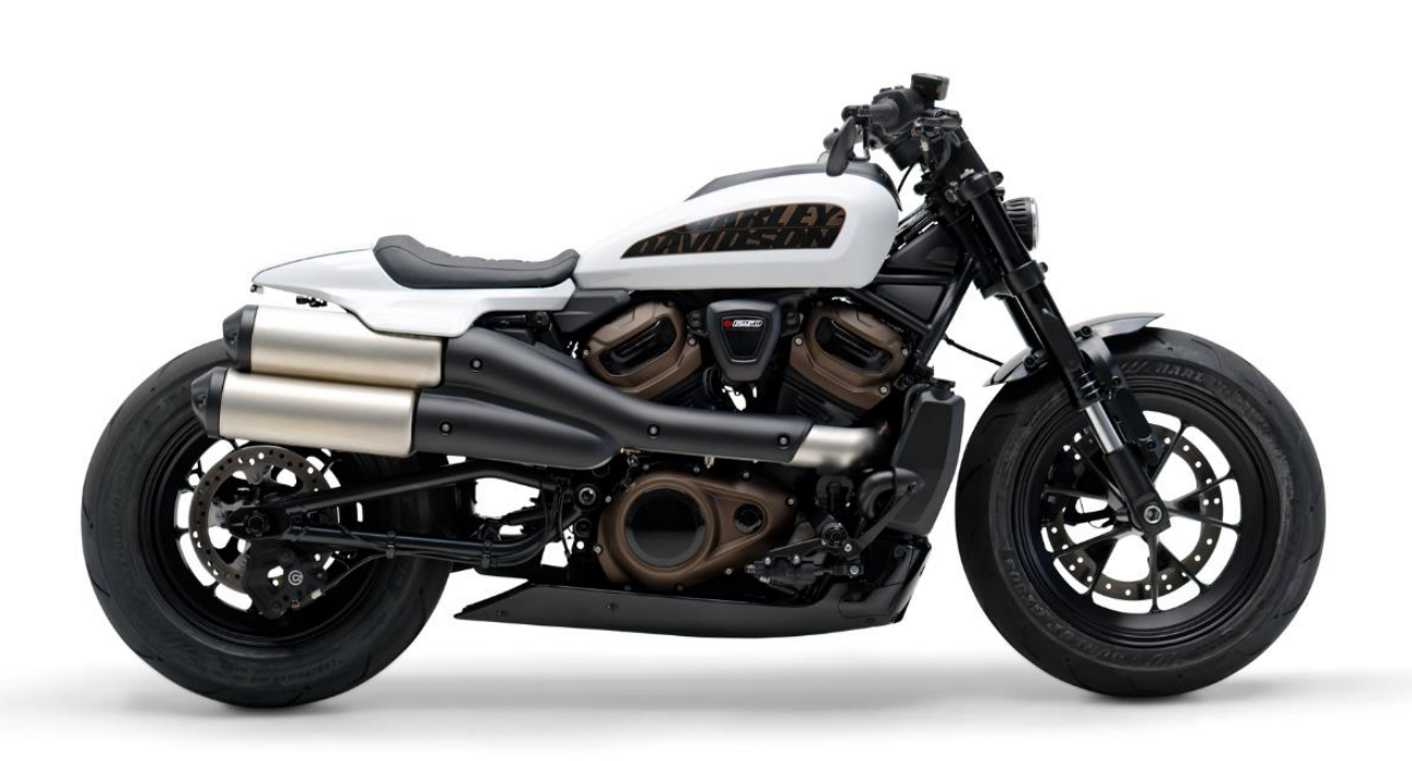
LED indicator 'littleOne' for the front