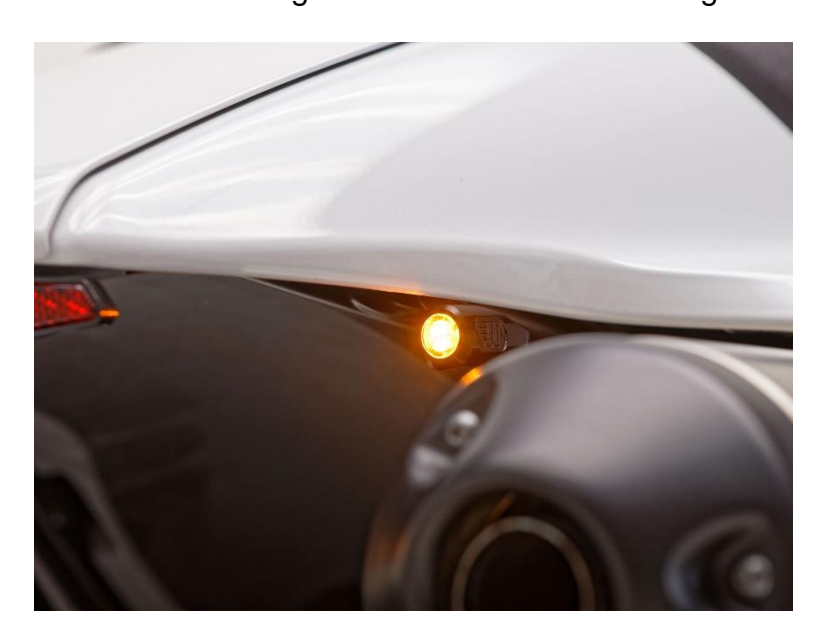
Reflector for rear mudguard